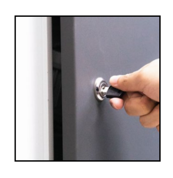
PRACTICAL The manual release is easy, intuitive and protected by a personal key.