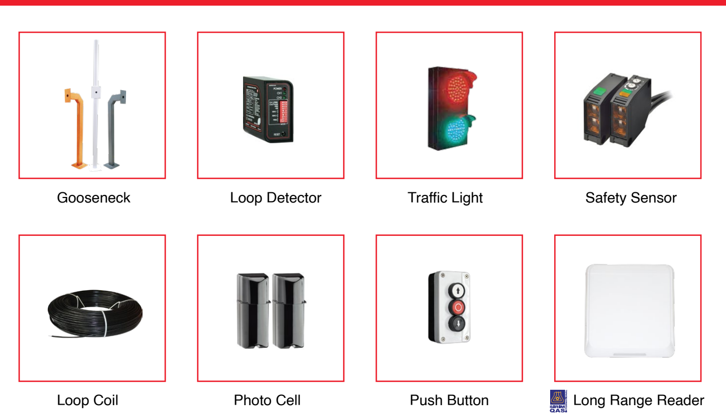
*All image and specification is subject to change without prior notice.