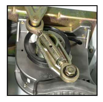
CONTROL Combination of automatic and manual opening for easy function.

The Ranger Eco Series barrier can be used to manage and maintain several entry points at the same time, both locally and remotely, ensuring the full functionality of accesses in every type of location such as car parks, shopping centres, resident, hotel, hospitals, airports and railway station as well as all others type of small or large public facility.